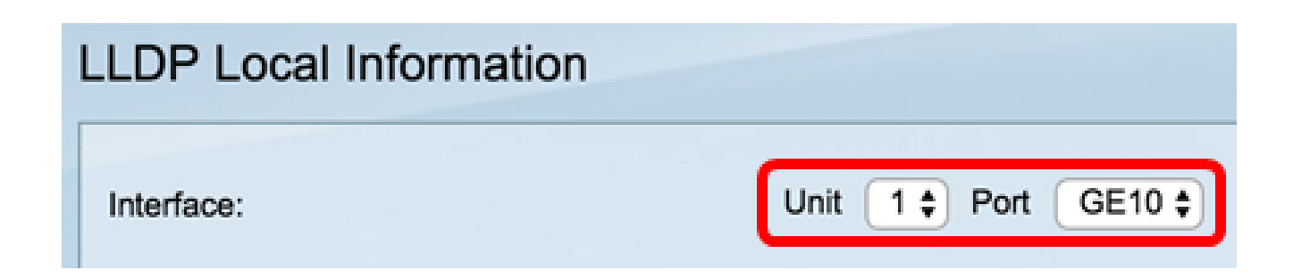
Step 2. Choose the desired interface type from the Interface drop-down lists.

Note: In this example, Port GE10 of Unit 1 is chosen.