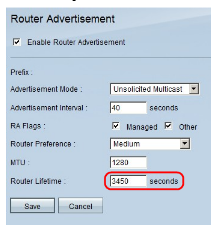
Step 7. Enter the lifetime that the Router Advertisement messages that will exist on router (seconds) in the Router Lifetime field. The default is 3600 seconds.

Note: MTU should not be smaller than 1280 and not be greater than the maximum MTU allowed for the given link.