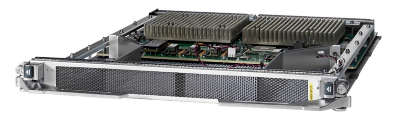
Figure 1. Cisco ASR Switch Fabric Card 2

The Cisco ASR 9900 Switch Fabric Card 2 (Figure 1), Switch Fabric Card S (Figure 2) and Switch Fabric Card T (Figure 3) are the next-generation switch fabrics for the Cisco ASR 9922 Router, ASR 9912 Router, ASR 9910 Router and ASR 9906 Router, supporting high-density 100 Gigabit Ethernet line cards. The system architecture of the Cisco ASR 9900 Switch Fabric Card 2 (ASR 9900 SFC2), Switch Fabric Card S (ASR 9900 SFC-S) and Switch Fabric Card T (ASR 9900 SFC-T) is designed to accommodate new programmable deployment models and convergence of Layer 2 and Layer 3 services, as required by today's wireline, Data-Center-Interconnect (DCI), and Radio Access Network (RAN) aggregation applications.