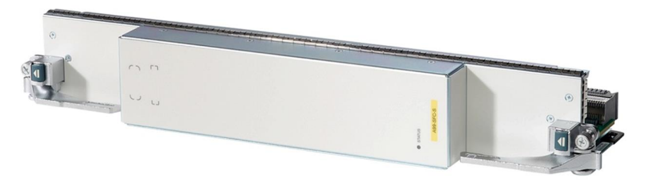
Figure 2. Cisco ASR Switch Fabric Card S