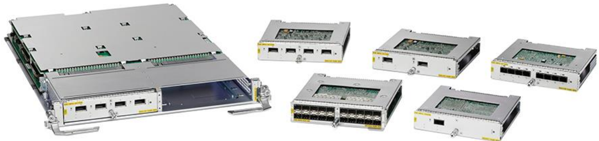
Figure 1. Cisco ASR 9000 Series Modular Line Cards

Using the modular line cards, the Cisco ASR 9000 Series can support customer applications including video-on-demand, Internet Protocol Television (IPTV), point-to-point video, Internet video, and cloud-based computing. These line cards can also be used to deliver economical, scalable, highly available, line-rate Ethernet and IP/Multiprotocol Label Switching (IP/MPLS) edge services. The Cisco ASR 9000 Series line cards and routers are designed to provide the fundamental infrastructure for scalable Carrier Ethernet and IP/MPLS networks, supporting profitable business, residential, and mobile services (Figure 1).