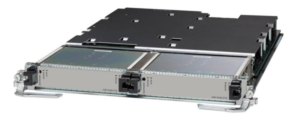
Figure 1. Cisco ASR 9000 Series Integrated Service Module

The service hosted on an ISM may be changed at any time by changing the service image loaded on the ISM. Multiple services can coexist on multiple ISMs in the same Cisco ASR 9000 system.