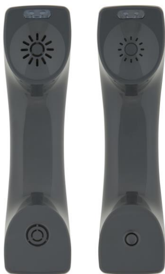
Figure 1. Cisco Unified Wideband and Narrowband Handsets

The new Cisco Unified Wideband Handset (left) looks similar to the Cisco Unified Narrowband Handset (right) (Figure 1).