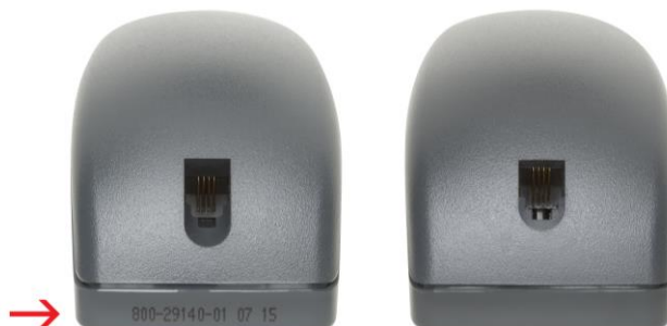
Figure 2. Cisco Unified Wideband and Narrowband Handset

The Cisco Unified Wideband Handset also has a 14-digit number printed below the handset cord connection to make it easier to identify (Figure 2).